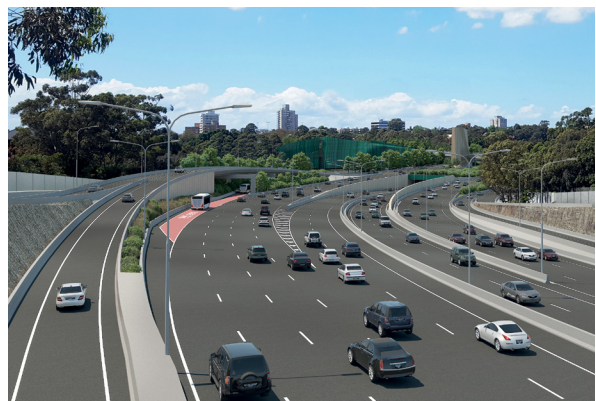
Artist's impression: view from the Miller Street bridge. Subject to change following detailed design

Service and utility relocation and removal work will be starting in March. This work is being carried out by the Sydney Program Alliance on behalf of Transport for NSW. This work will include establishing four temporary site compounds, above and below ground service and utilities relocations and removal including power, water, sewer and telecommunications.