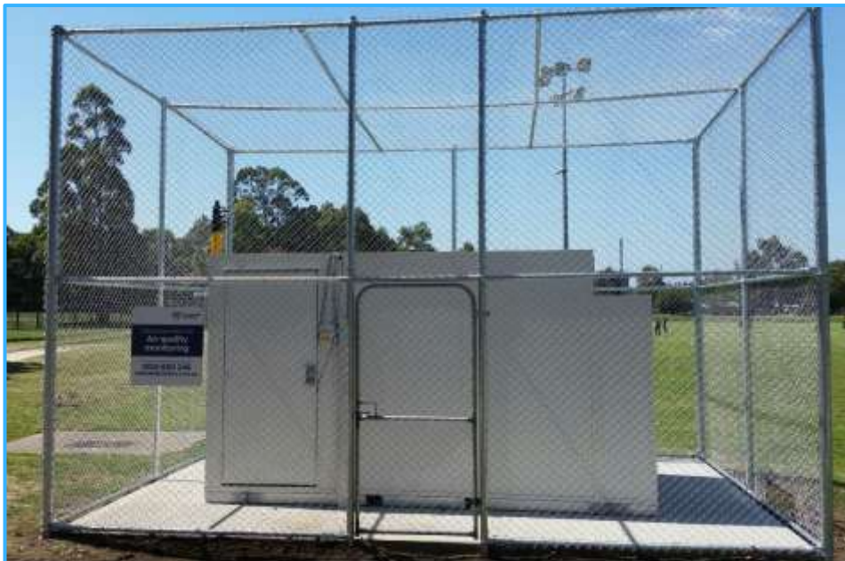
Image of air quality monitoring station

Indicative location of monitoring station - Bantry Bay Reserve, Seaforth, near the end of Reserve Street