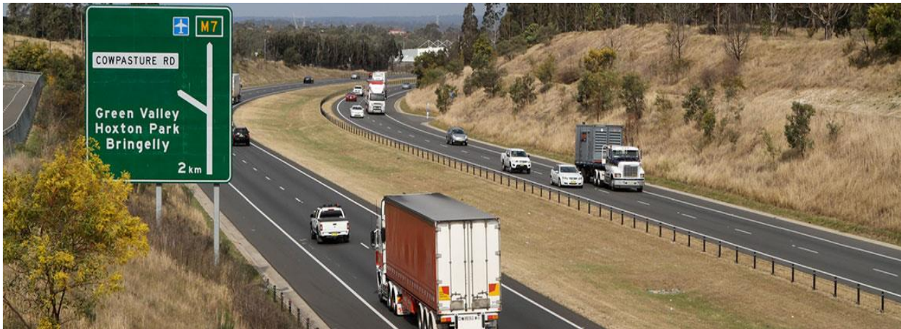
Westlink M7 Motorway near Cowpasture Road, Len Waters Estate