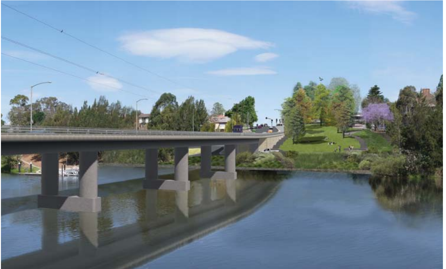
Artist's impression of the new bridge looking south from the northern bank