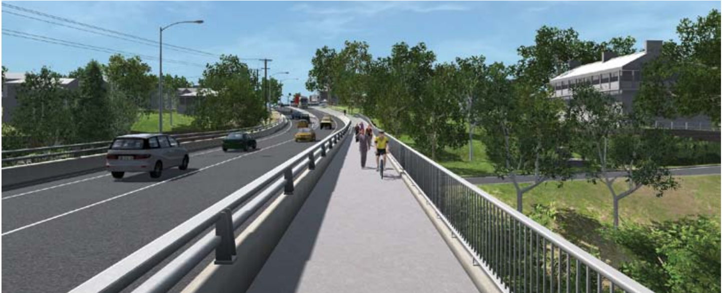
Artist's impression of the new bridge looking south