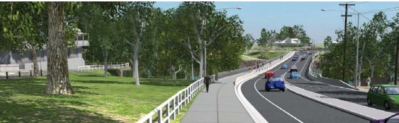
Artist's impression of the bridge looking north