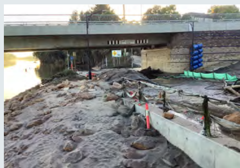
Landscaping and rock scouring to be cleaned up and replaced along the river bank at the bottom of Thompson Square