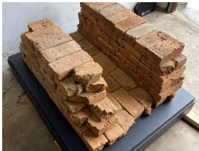
Reconstructed brick drain, prior to final transport to museum