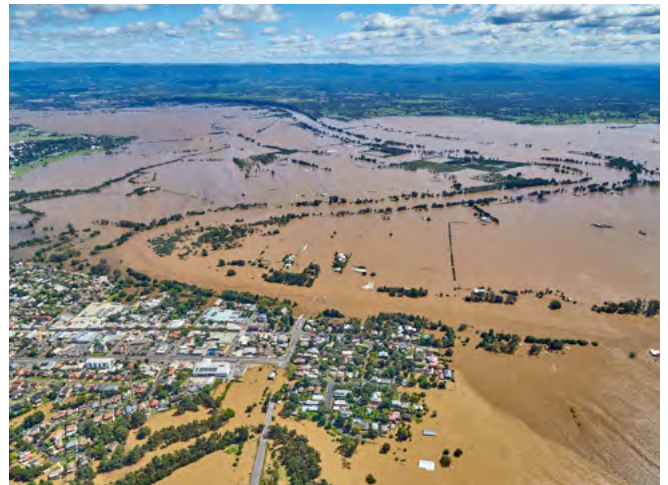
Aerial view during the March flood

This most recent flood event was a rare and extreme event seeing water levels surpass many previous floods in the area.