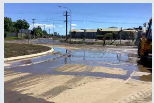
Cleaning up the roundabout at Wilberforce Road, Freemans Reach Road and Bridge Street