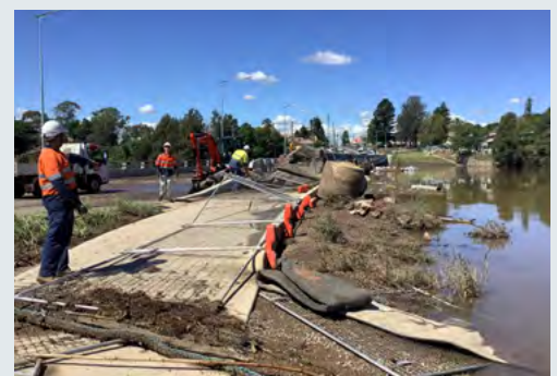
Construction fencing will need to be reinstalled and made secure