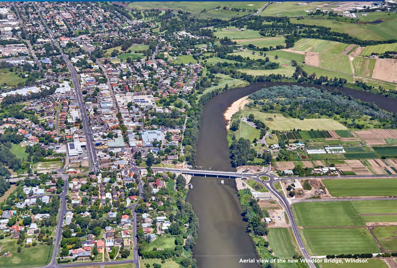
Aerial view of the new Windsor Bridge, Windsor.

The NSW Government is providing a safe and reliable crossing of the Hawkesbury River at Windsor with the new Windsor Bridge.