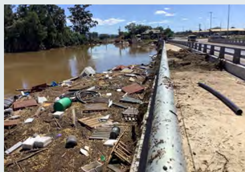
Debris caught underneath the bridge, looking north from Thompson Square side

We thank the community for their patience and support as we continue to work towards project completion in the coming months.