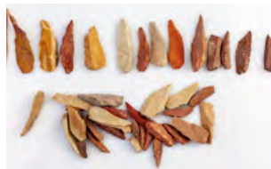
Aboriginal stone artefacts