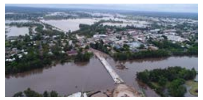
Aerial view during the February flood