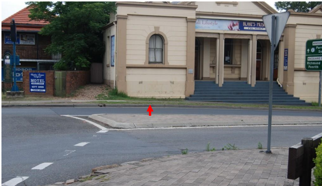
Plate 4: View east showing Bridge Street and the School of Arts building; the position of the test trench is indicated by the arrow

The proposed trench in the research design was intended, in a three-metre length to include the site of the northern wall of the 1803 building and a sample of the internal space. The southern wall was in an area of services and the western wall was in the road. The reduction of the trench size due to the need to avoid live services meant that the trench was likely to sample only the internal space of the building or, perhaps, allowing for a degree of variation in the 1831 survey and modern townscape, a foundation trench for that wall as well as evidence of the construction associated with the building or its demolition in the form of debris.