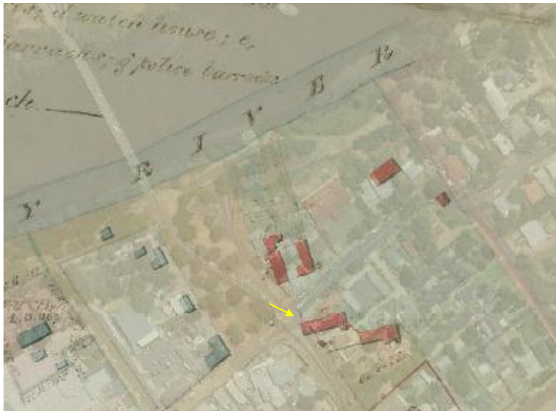
Plate 3: Overlay of 1831 survey onto contemporary aerial image showing the relationship of the Commissariat Store of 1803 to the present School of Arts building and Bridge Street

Overlays of historic period surveys from the first half of the nineteenth century in relation to the present roads and buildings demonstrate that the site of the former Commissariat building of 1803 is likely to lie under the School of Arts building. The older building appears to have projected beyond the western façade of the School of Arts into the present footpath and Bridge Street.