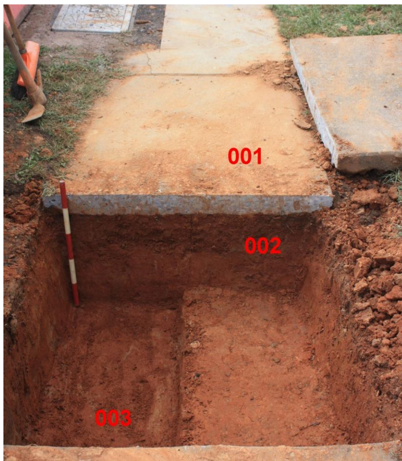
Plate 8: View north of Trench 10 showing sandstone bedrock at the base of the trench and its immediate relationship to the clay above it. This image also highlights the more disturbed nature of the upper part of the clay visible here in the shadow as a darker and slightly more textured material; scale 500 mm