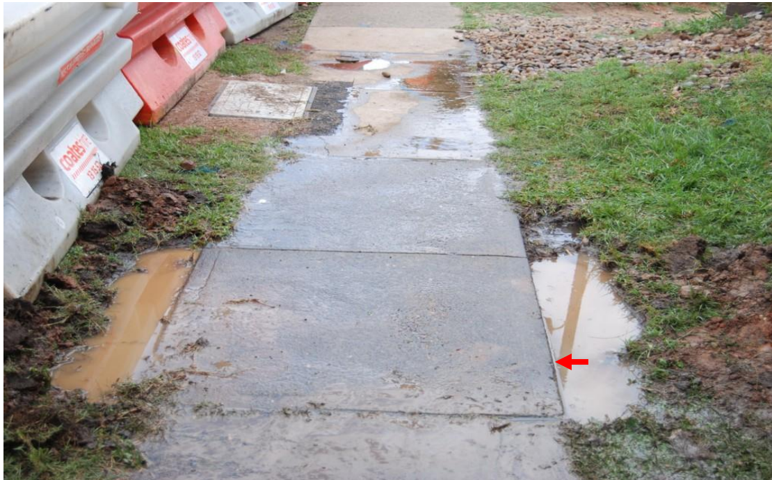
Plate 5: View north showing the slab to be removed (indicated by the arrow) for the test trench with the recent disturbance just to the north of this site caused by enlarging a service pit also visible