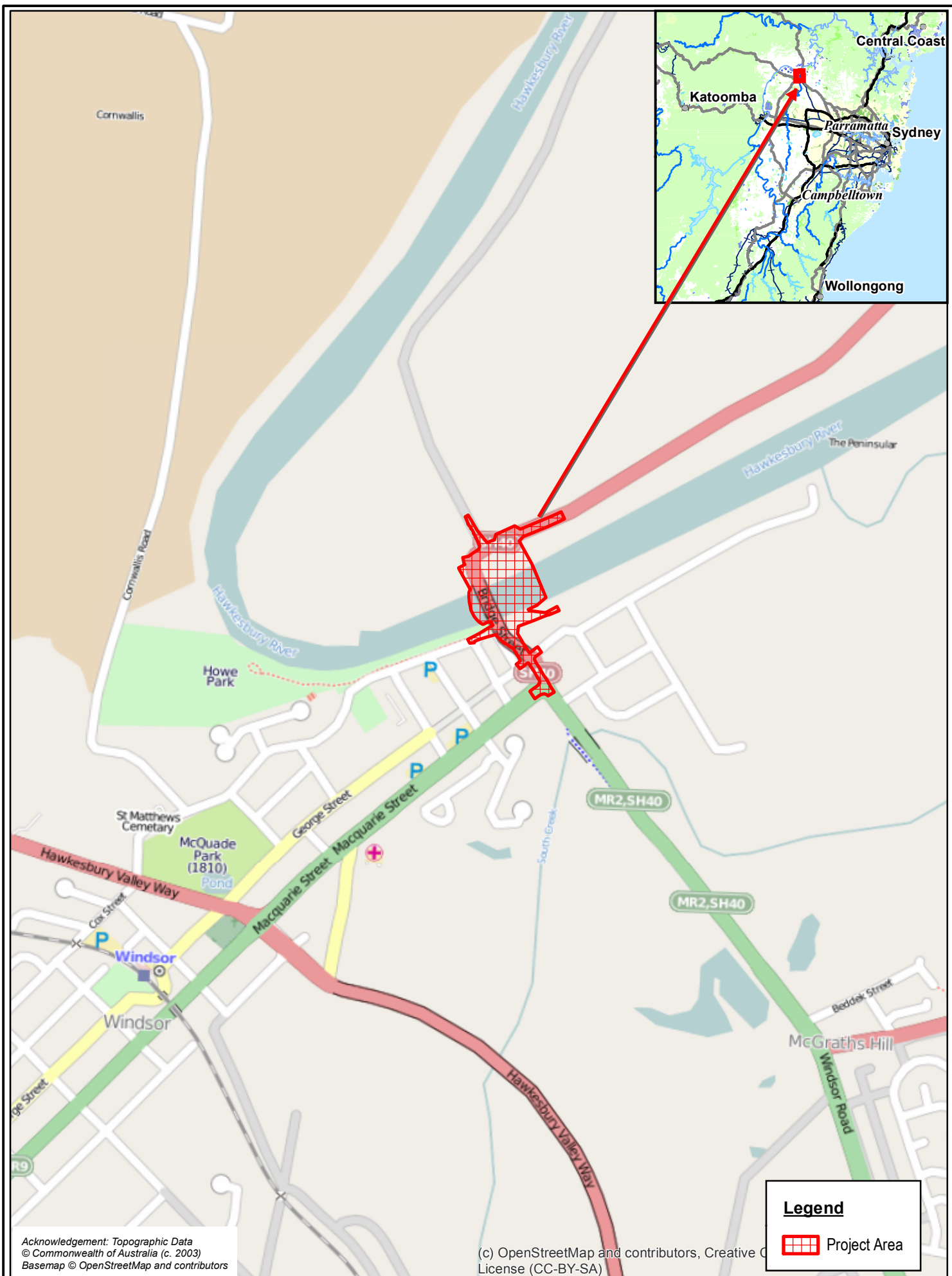
Figure 1: Location of the Study Area in a Regional Context

Date: 31 August 2012 Matter: 14020 Checked By: PBK Drawn By: JMS Location: P:\14000s\14020\Mapping\14020_SoHIF1_Locality.mxd