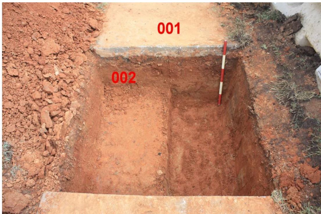
Plate 7: View south of Trench 10 showing the clay with sand lenses underlying the footpath on the eastern side of Bridge Street; scale 500mm