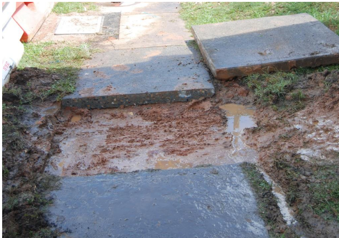
Plate 6: View north showing the footpath slab [001] removed from the trench revealing the surface of the underlying deposit [002]

The surface slab from the footpath [001] was lifted in one piece. It is made from cement with bluestone inclusions poured into formwork. It is approximately 60 mm thick and was laid directly over the underlying deposit of clay [002] .