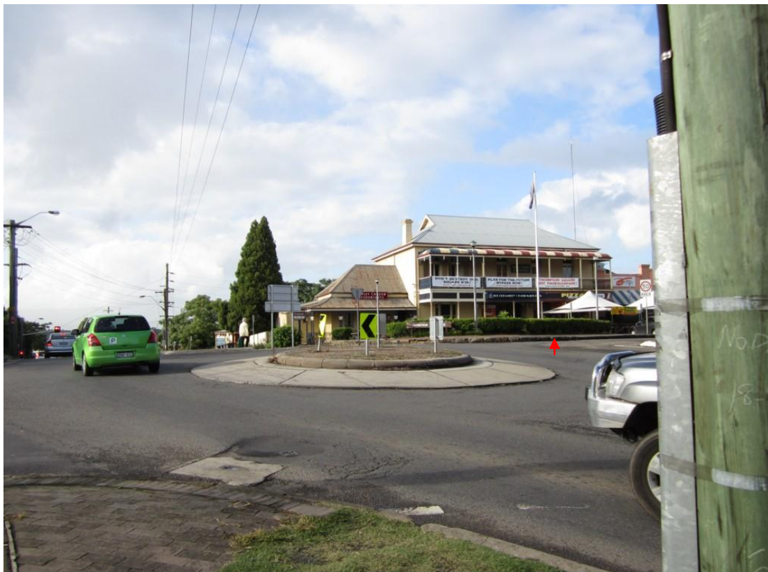
Plate 9: View south at the intersection of George and Bridge Streets showing the investigation area along George Street indicated by the arrow

The location of this test trench on George Street has been discussed in Section 2.6.1; it was the only viable location free of services, which could accommodate the width of the excavator bucket between the safety barrier and the garden bed, very close to the proposed test trench site and with the same archaeological potential in the project area. The sample provided from this area was expected to provide evidence of road development and possibly accumulated deposits that would characterise the use of this area as a public thoroughfare from early in the nineteenth century. The excavated trench measured 1000 x 1200 mm.