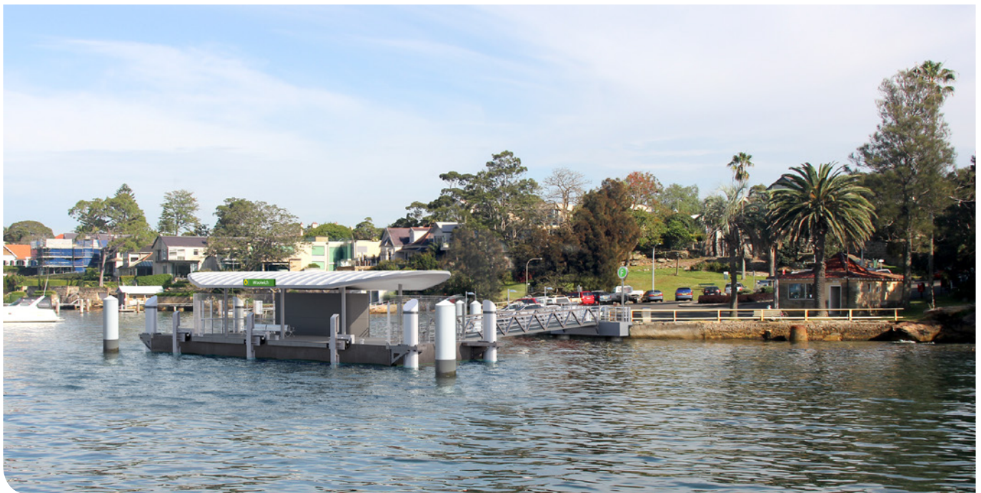
An artist's impression of the proposed new Woolwich Wharf viewed from the water

The NSW Government is upgrading Woolwich Wharf as part of the Transport Access Program. A Review of Environmental Factors has been prepared for the upgrade and is on public display until Sunday 3 November 2019.