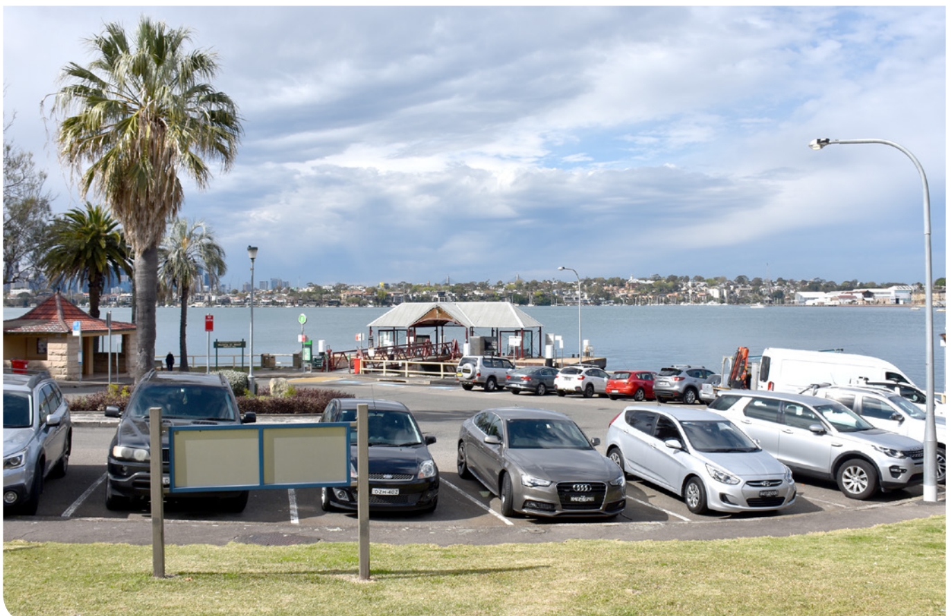
The existing Woolwich wharf shelter and car park

Customers would be encouraged to plan their trip by visiting transportsw.info or calling Transport Info on 131 500 before starting their journey.