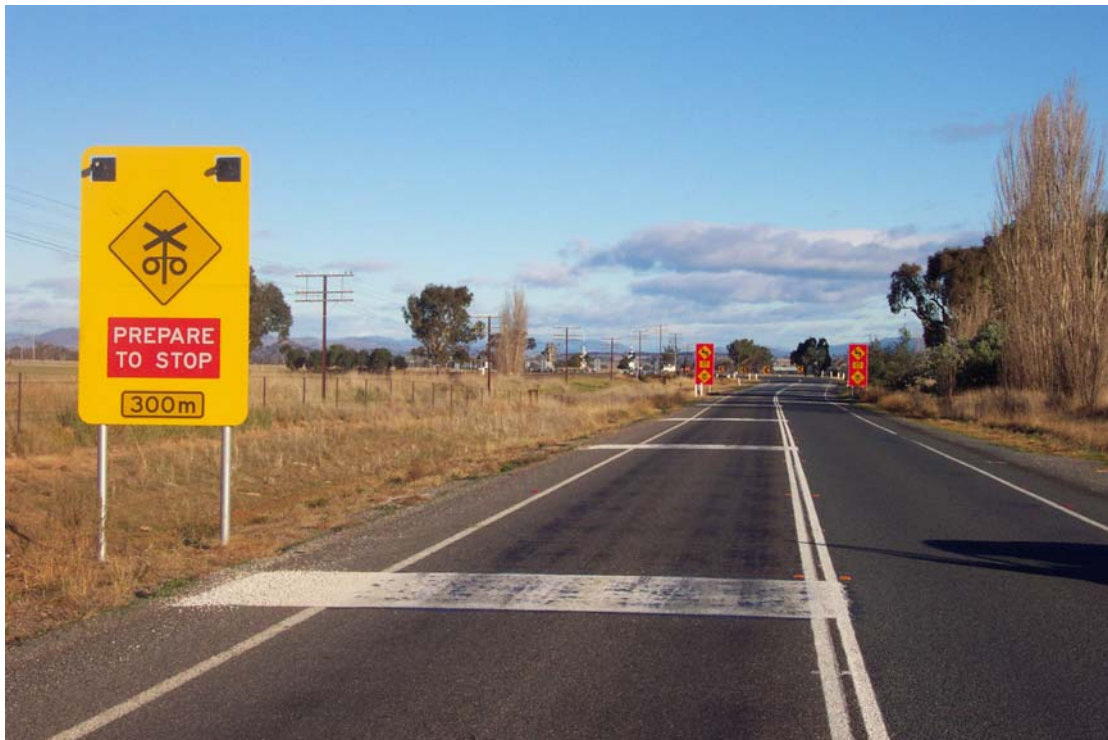
Advanced Warning Improvements - Olympic Highway (Bells Rd) Level Crossing - Gerogery