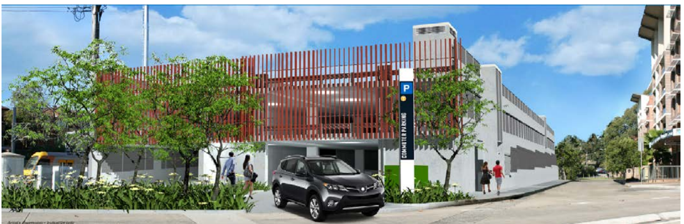
Artist's impression of Ashfield Commuter Car Park, subject to detailed design

For more information call 1800 684 490 , Email projects@transport.nsw.gov.au or visit transport.nsw.gov.au/projects For urgent enquiries or complaints regarding construction activities, please call 24 hours 1800 775 465