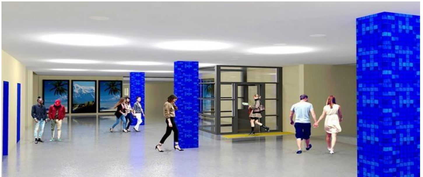
Image: Artist's impression of lift on concourse, subject to detailed design.

The Transport Access Program is a Transport for NSW initiative to provide a better experience for public transport customers by delivering accessible, modern, secure and integrated transport infrastructure.