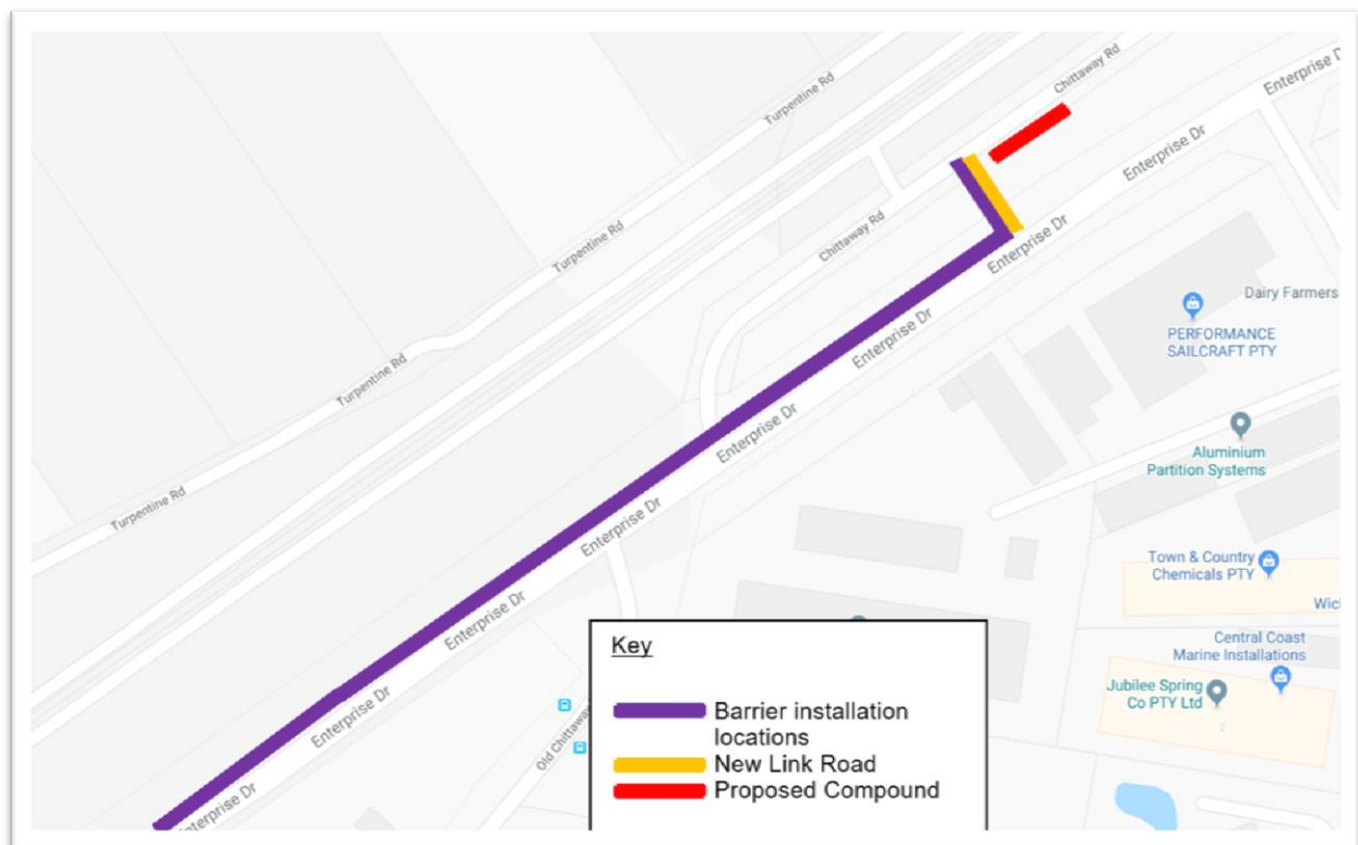
Figure 1: Location of the link road and proposed site compound

Access along Chittaway Road will be maintained in an altered configuration. Road signs will guide road users through the change.