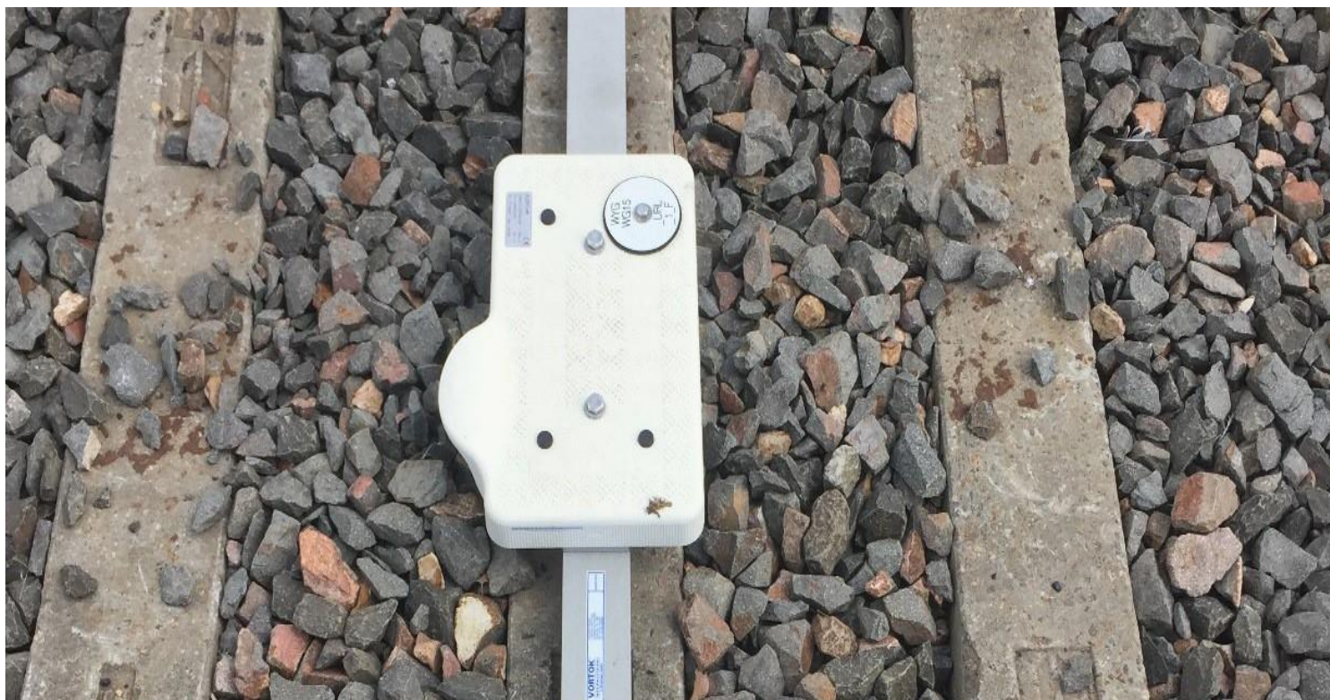
Picture of a 'balise' – an electronic transponder that monitors train speeds.