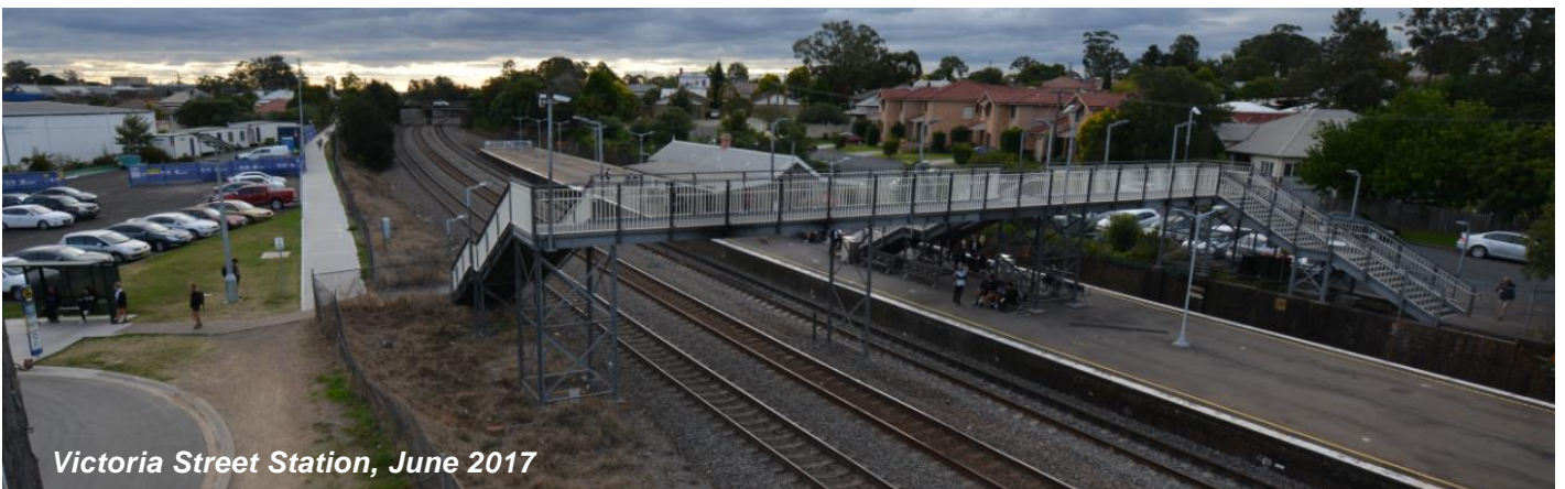
Victoria Street Station, June 2017

The Victoria Street Station Upgrade is creating an accessible station for customers, through the construction of new lifts, canopies, upgraded safety features and new station technologies.