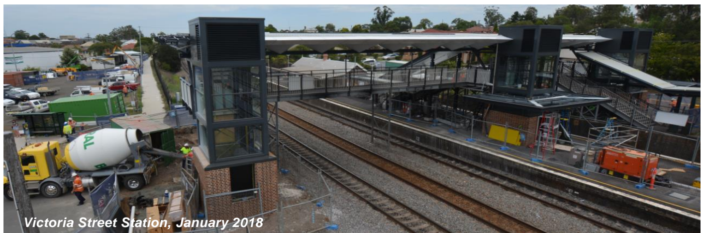
Victoria Street Station, January 2018

For more information call 1800 684 490 , Email projects@transport.nsw.gov.au or visit transport.nsw.gov.au/projects-tap For urgent enquiries or complaints regarding construction activities, please call 24 hours 1800 775 465