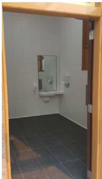
Completed family accessible toilet facilities