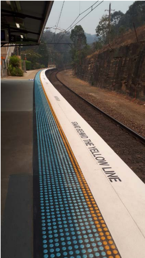
Tactile indicators at Glenbrook station