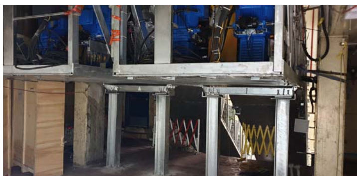
Images: Escalator 3 & 4 construction progress

For more information call 1800 684 490 , Email projects@transport.nsw.gov.au or visit transport.nsw.gov.au/projects-tap For urgent enquiries or complaints regarding construction activities, please call 24 hours 1800 775 465