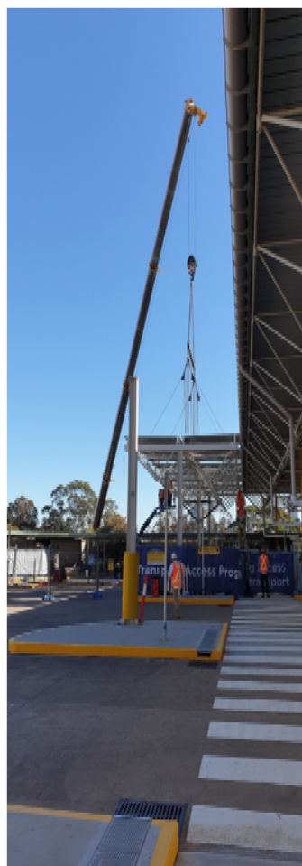
Images: Bus Canopy craneage installation