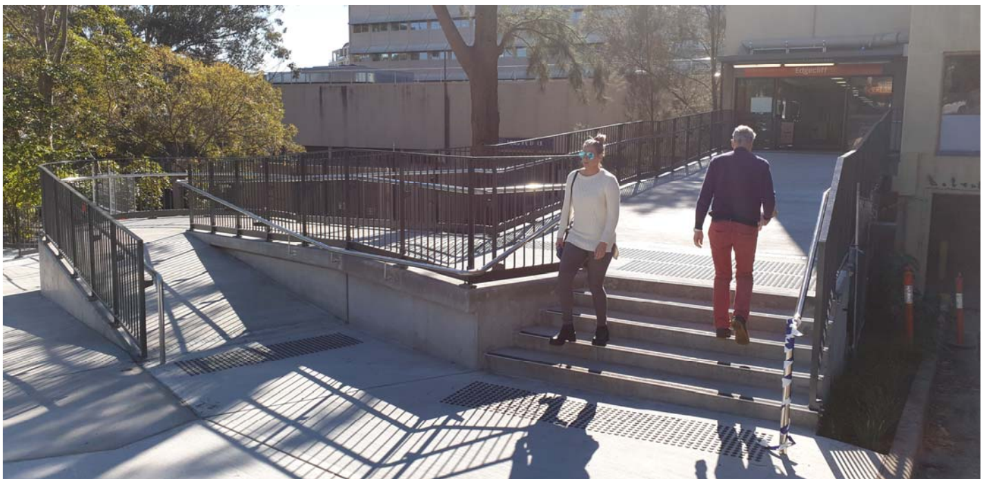
Image: Ramp newly opened and in use.

Last month we made great progress on the project, by opening the new access ramp on New McLean Street and completing the bus canopy extension.