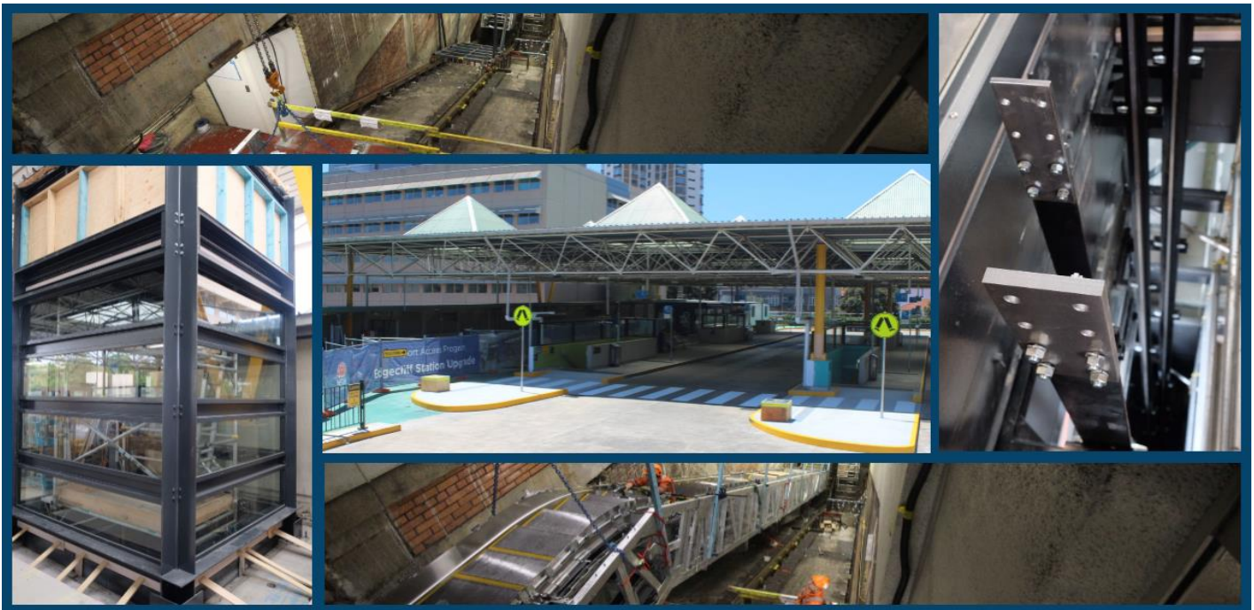
Image: included images of escalator stages, lift details and kerb extension completion.

The Transport Access Program is a Transport for NSW initiative to provide a better experience for public transport customers by delivering accessible, modern, secure and integrated transport infrastructure.