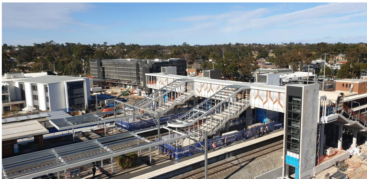
View of the new Rooty Hill Station, photo taken from the new Commuter Car Park on North Parade.

The new footbridge will open later this month and the old station footbridge will be removed. Signage will be installed to assist customers with access changes and construction will continue on the new lifts, with opening scheduled for early 2020.