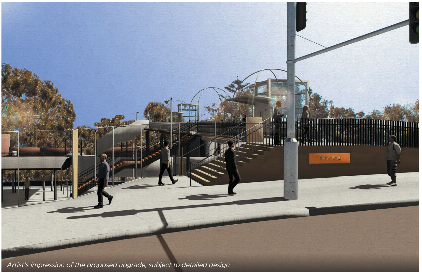
Artist's impression of the proposed upgrade, subject to detailed design