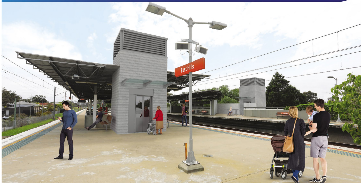
Artist's impression of the proposed East Hills Station Upgrade, subject to detailed design