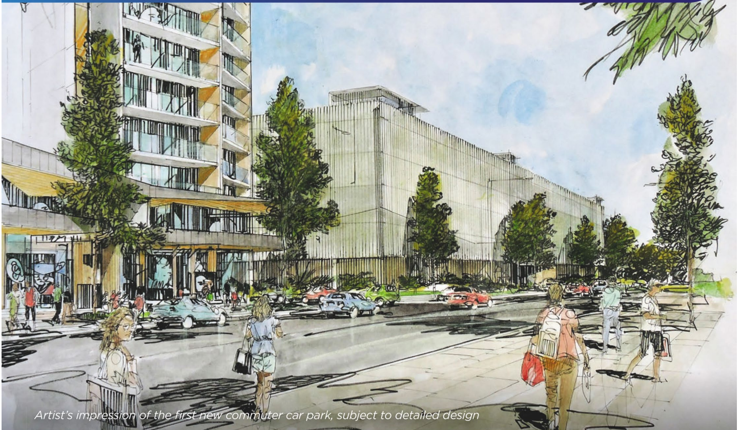
Artist's impression of the first new commuter car park, subject to detailed design