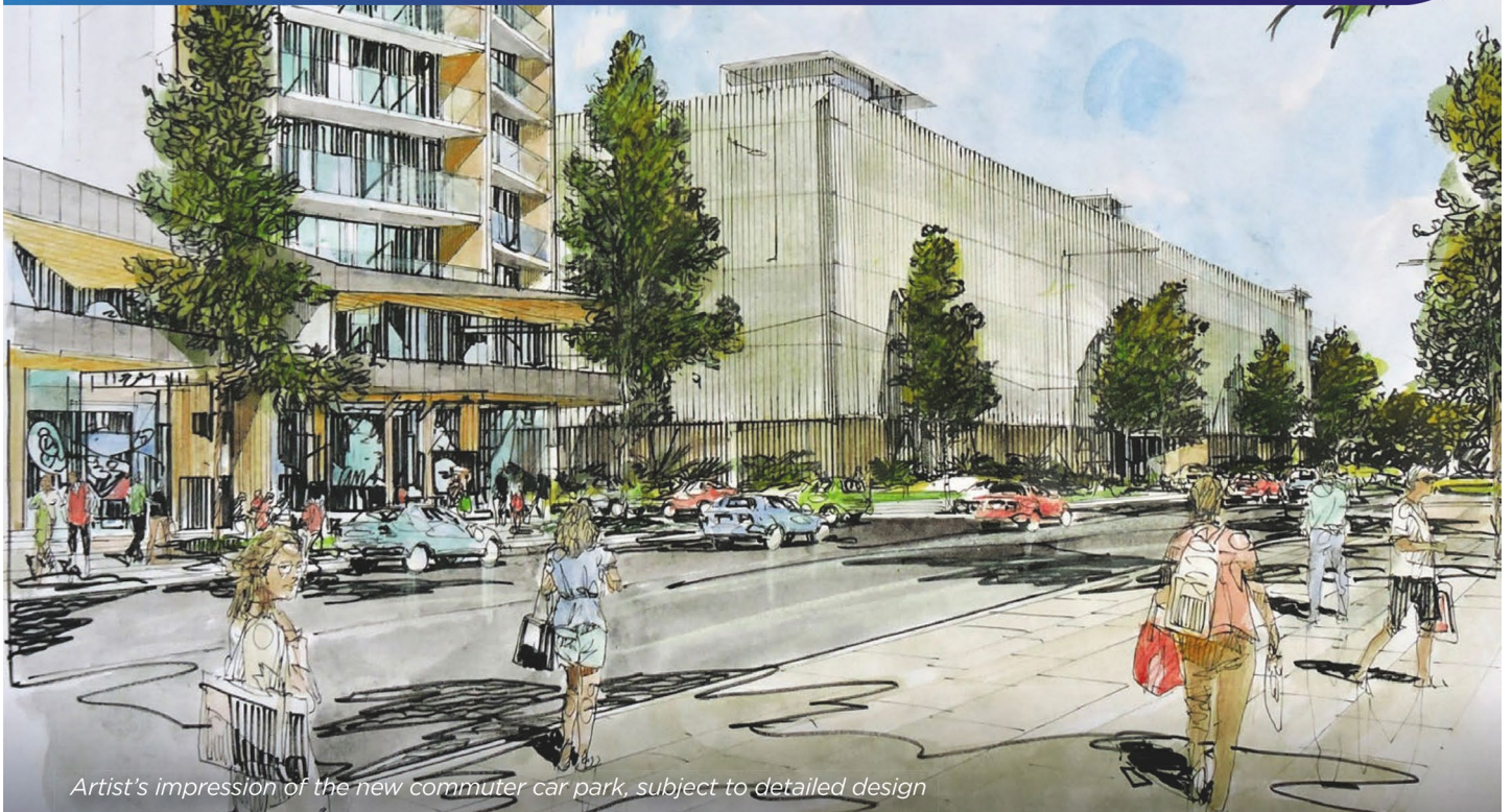
Artist's impression of the new commuter car park, subject to detailed design