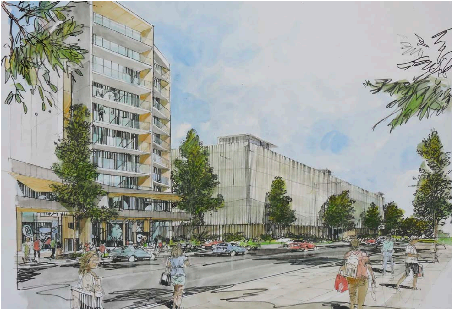
Above: Artist impression Edmondson Park Commuter Car Park, subject to detailed design

Transport for NSW is delivering additional commuter car parking at Edmondson Park Station to provide you with more convenient access to public transport and reduce congestion on our roads. The first step of delivering up to 2,000 additional spaces is underway and includes: