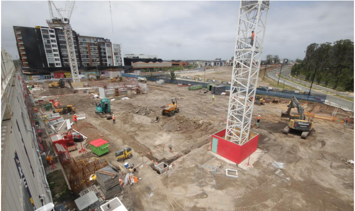
Construction progress on the new multi-storey car park at Edmondson Park, December 2020

Transport for NSW is delivering more commuter car parking at Edmondson Park Station to provide you with more convenient access to public transport and reduce congestion on our roads.