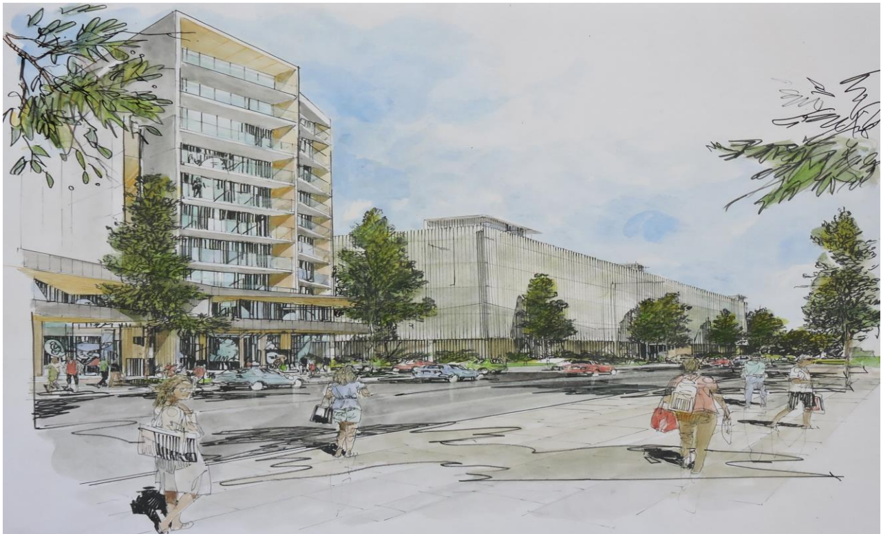
Artist's impression of the new multi-storey car park, subject to detailed design

Transport for NSW is delivering more commuter car parking at Edmondson Park Station to provide you with more convenient access to public transport and reduce congestion on our roads.