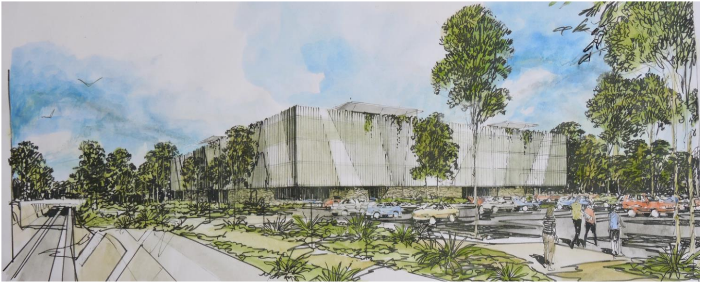
Artist's impression of Leppington Commuter Car Park, subject to detailed design

Transport for NSW is delivering a multi-storey car park with up to 1,000 additional parking spaces at Leppington Station to provide you with more convenient access to public transport and reduce congestion on our roads.