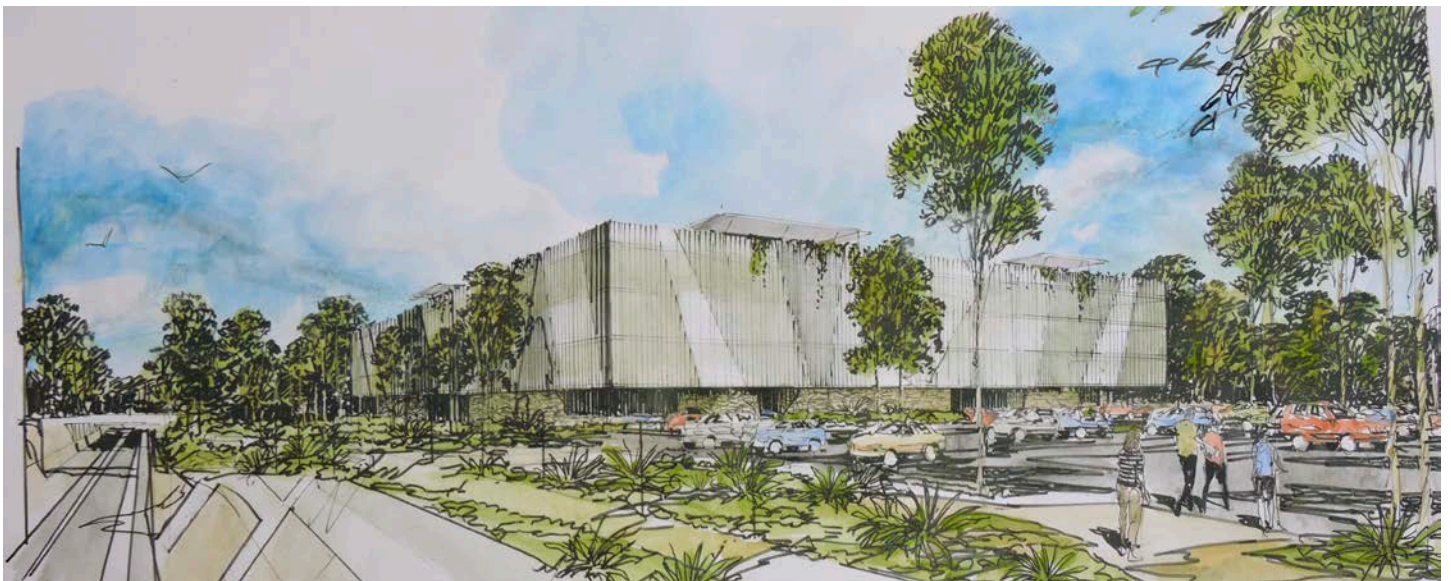
Artist's impression of Leppington Commuter Car Park, subject to detailed design

Transport for NSW is delivering more commuter car parking at Leppington Station to provide you with more convenient access to public transport and reduce congestion on our roads. Key benefits of the project include: