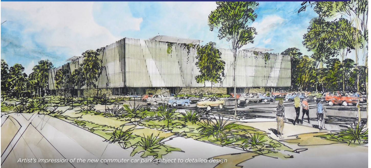
Artist's impression of the new commuter car park, subject to detailed design