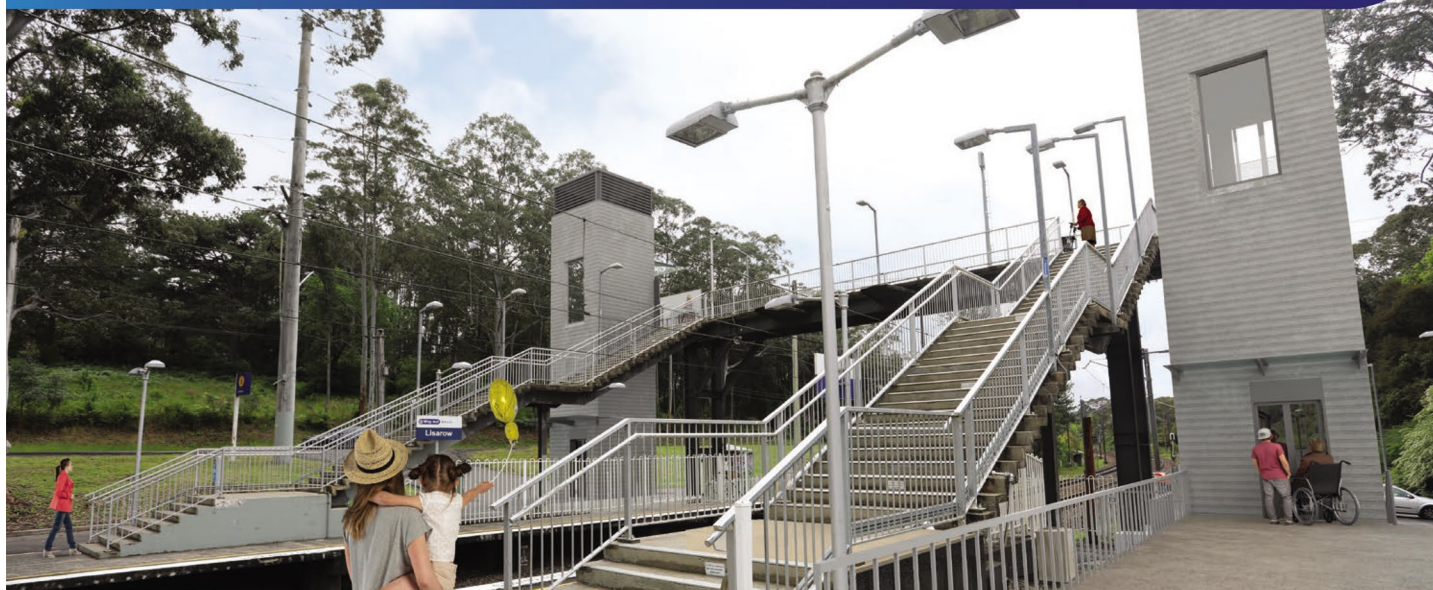
Artist's impression of the proposed Lisarow Station Upgrade, subject to detailed design