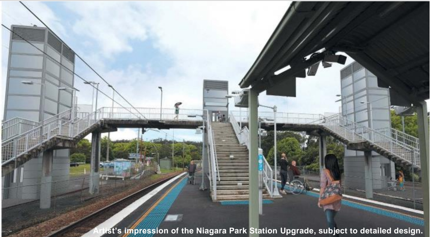
Artist's impression of the Niagara Park Station Upgrade, subject to detailed design.