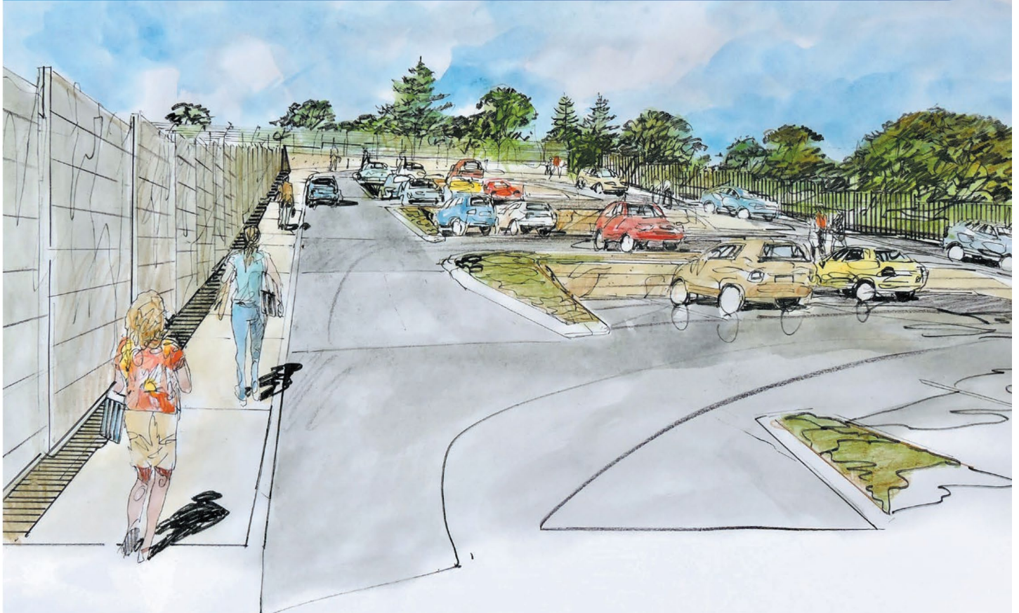
Artist's Impression of the proposed North Rocks commuter car park, subject to planning approval and detailed design