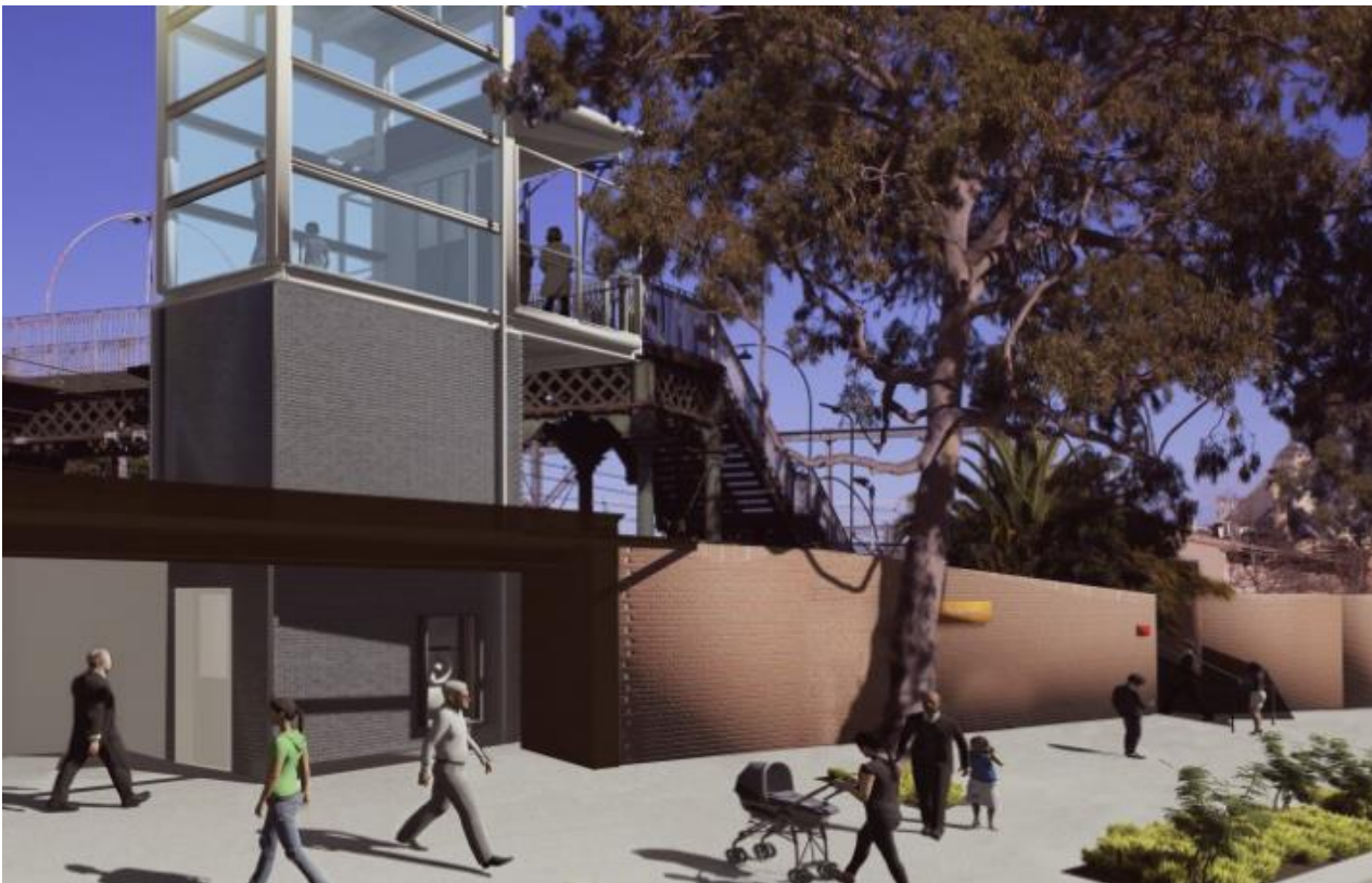
Artist's impression of the Petersham Station Upgrade. Indicative only.

Equipment which will be used during this work will include mobile cranes, delivery trucks, surveying equipment, generators, power and hand tools.