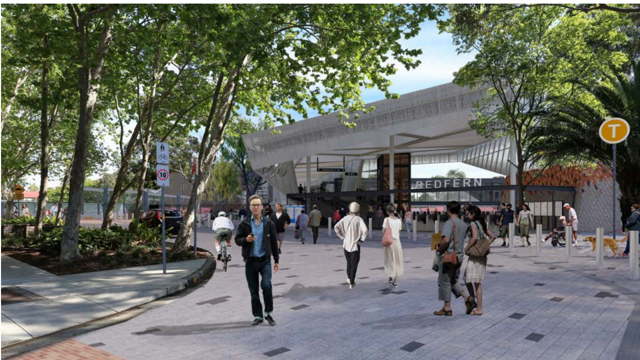
Artist's impression of the proposed Marian Street shared zone, subject to detailed design.

Marian Street would also be improved with an extended shared zone and new plaza entrance, with an architectural design, new bicycle parking, seating and plantings. To enable the extension of the existing shared zone on Marian Street and reduce vehicle movements for pedestrian safety, around 16 street parking spaces would be removed. These spaces would not be relocated as there is alternative street parking available nearby. However, a designated car-share parking space would be relocated to Rosehill Street.