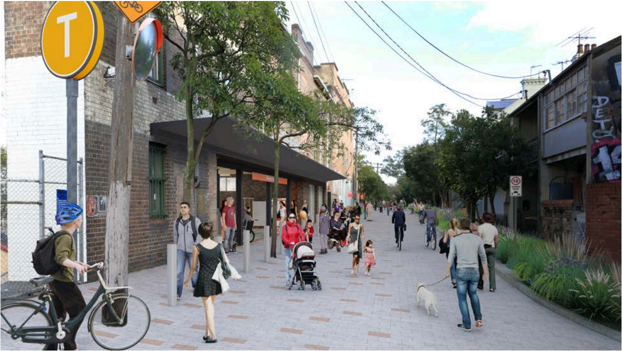
Artist's impression of the proposed Little Eveleigh Street station entrance and shared zone, subject to detailed design.