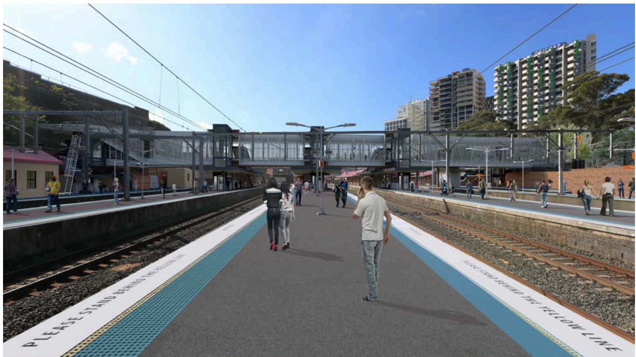
Artist's impression of the new southern concourse from Platforms 4/5, subject to detailed design.

Transport for NSW will continue to work with the City of Sydney and the community to look at opportunities to connect the project with current and future cycle paths.