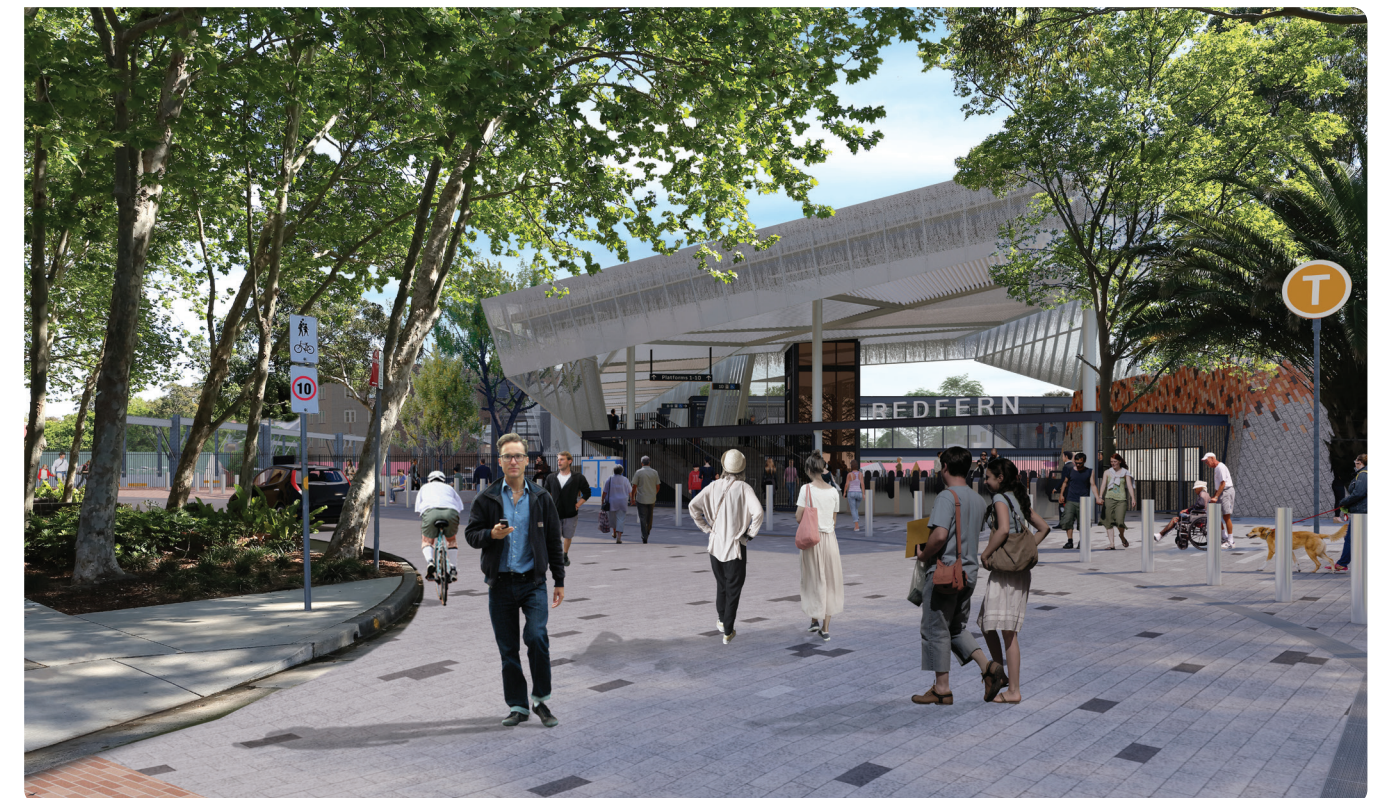
Artist's impression of the new station entrance – indicative only

The Department of Planning, Industry and Environment has approved construction of the new southern concourse at Redfern Station. This follows over 18 months of consultation and design development. Transport for NSW would like to thank the community for participating in our consultation activities.