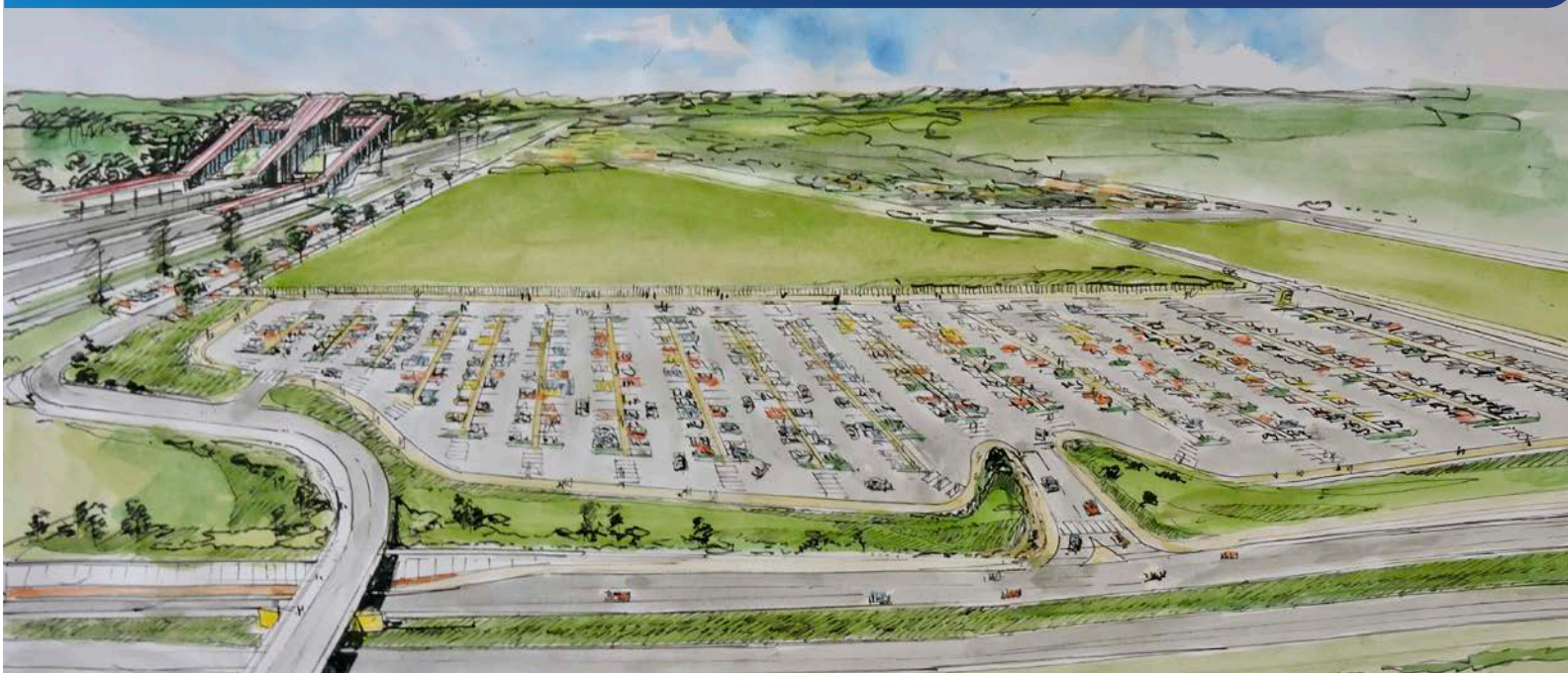
Artist's impression of the proposed commuter car park, subject to detailed design.