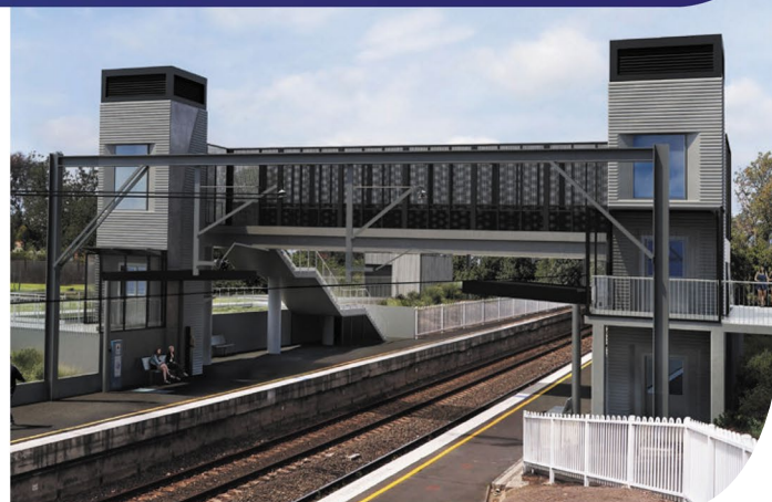
Artist's impression of the proposed Towradgi Station Upgrade, subject to detailed design