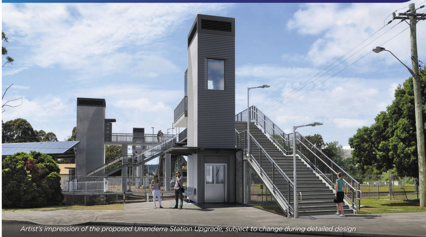
Artist's impression of the proposed Unanderra Station Upgrade, subject to change during detailed design