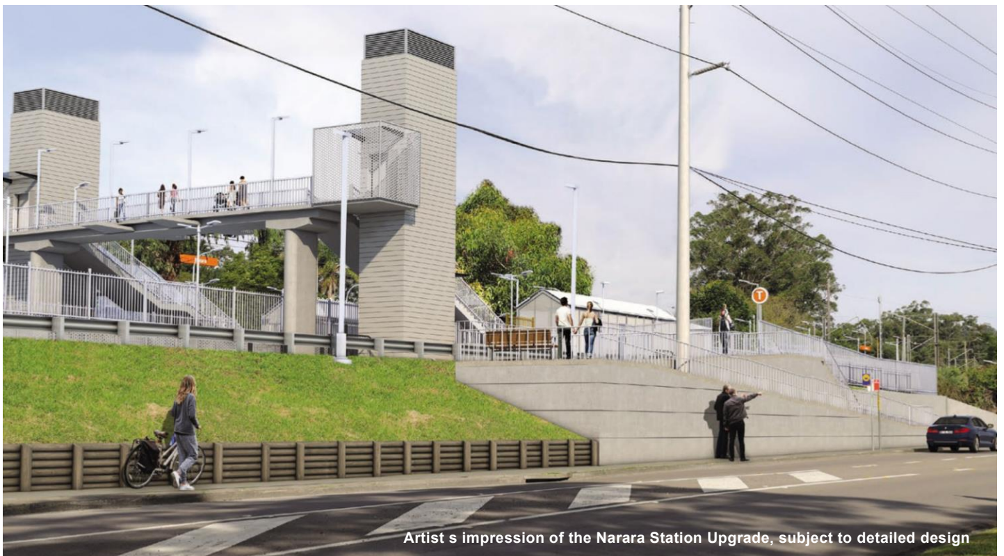
Artist's impression of the Narara Station Upgrade, subject to detailed design