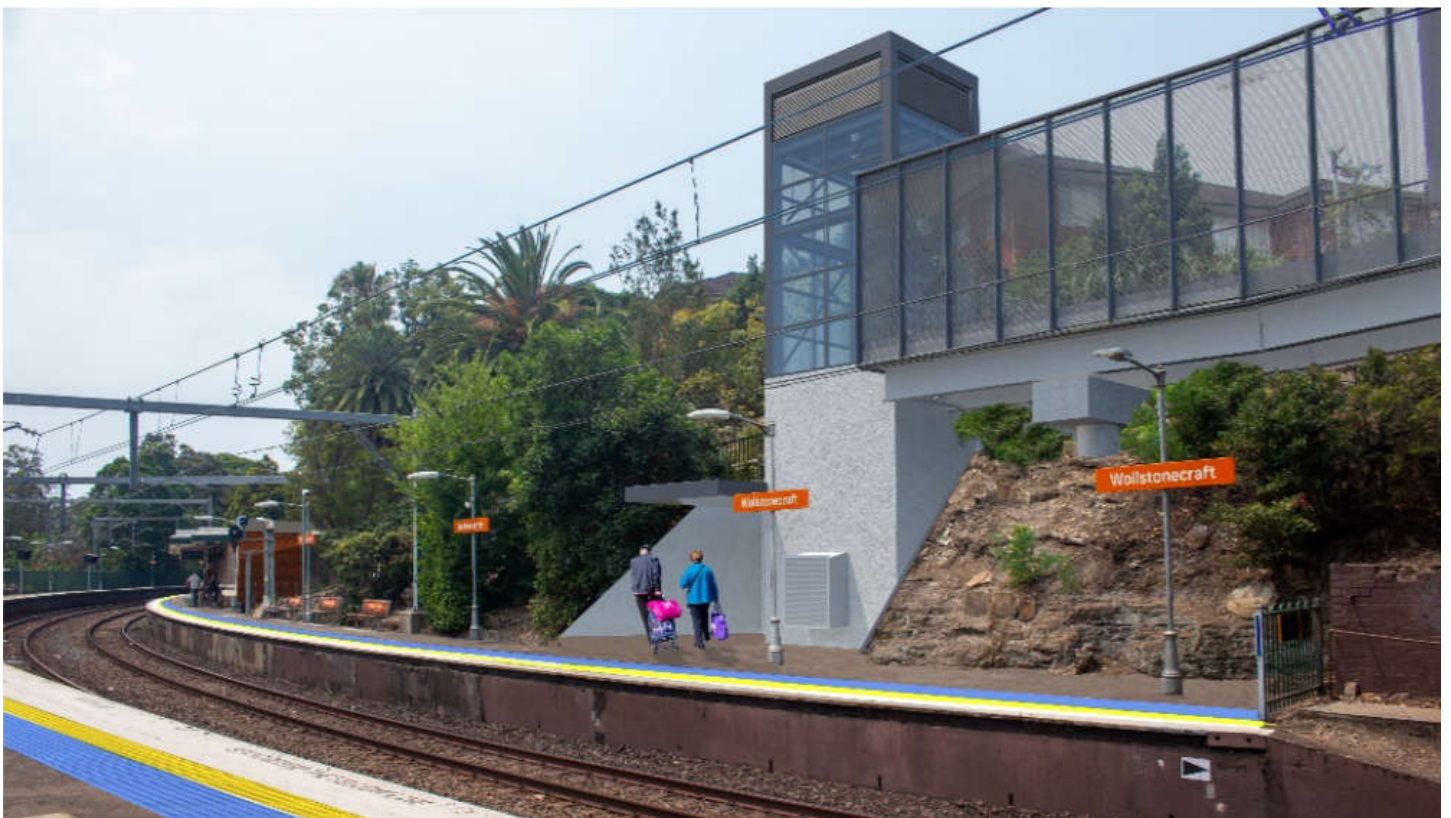
Artist's impression of Wollstonecraft Station upgrade, subject to detailed design.