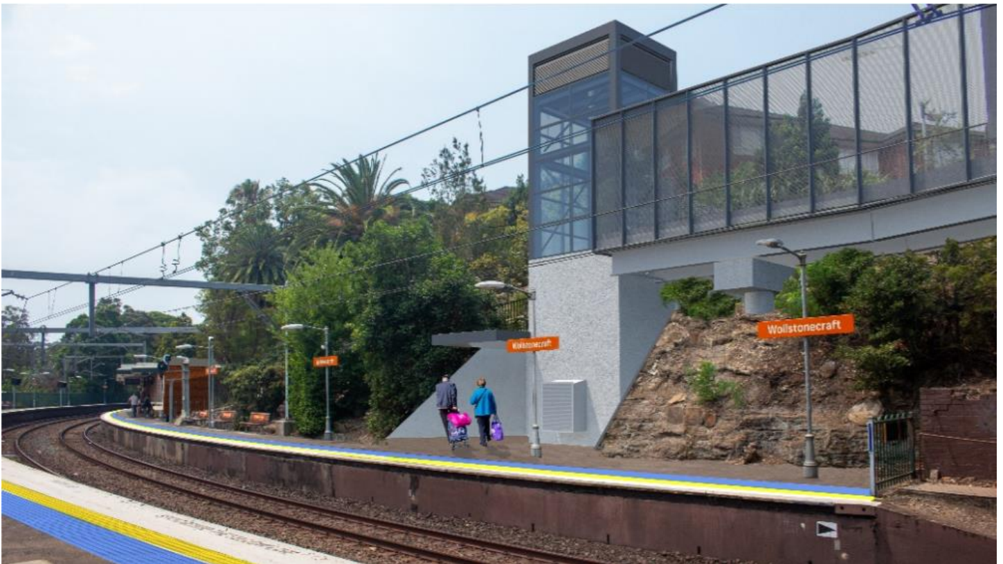
Artist's impression of Wollstonecraft Station Upgrade, subject to detailed design.

Transport for NSW is upgrading Wollstonecraft Station to make it easier for everyone to access, including people with a disability or limited mobility, parents/carers with prams, and customers with luggage.