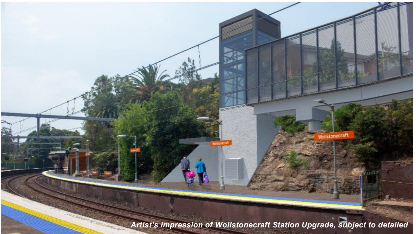
Artist's impression of Wollstonecraft Station Upgrade, subject to detailed

Transport for NSW is upgrading Wollstonecraft Station to make it easier for everyone to access, including people with a disability or limited mobility, parents/carers with prams, and customers with luggage.