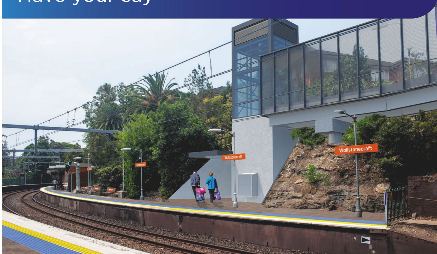
Artist's impression of the proposed Wollstonecraft Station Upgrade, subject to change during detailed design