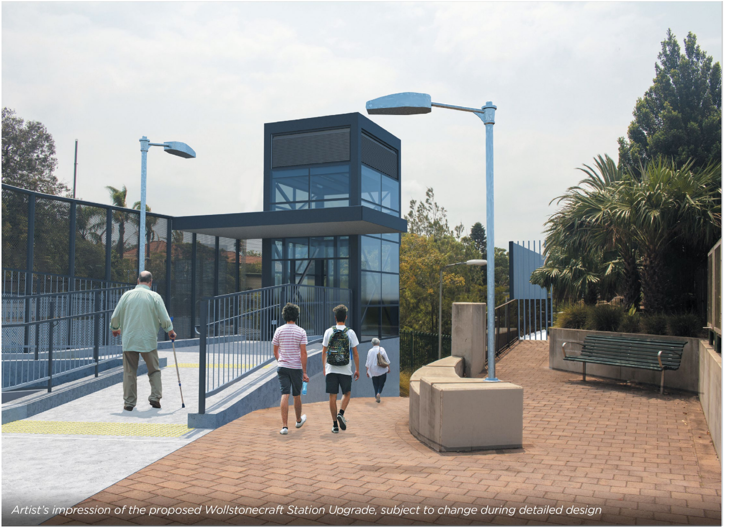
Artist's impression of the proposed Wollstonecraft Station Upgrade, subject to change during detailed design