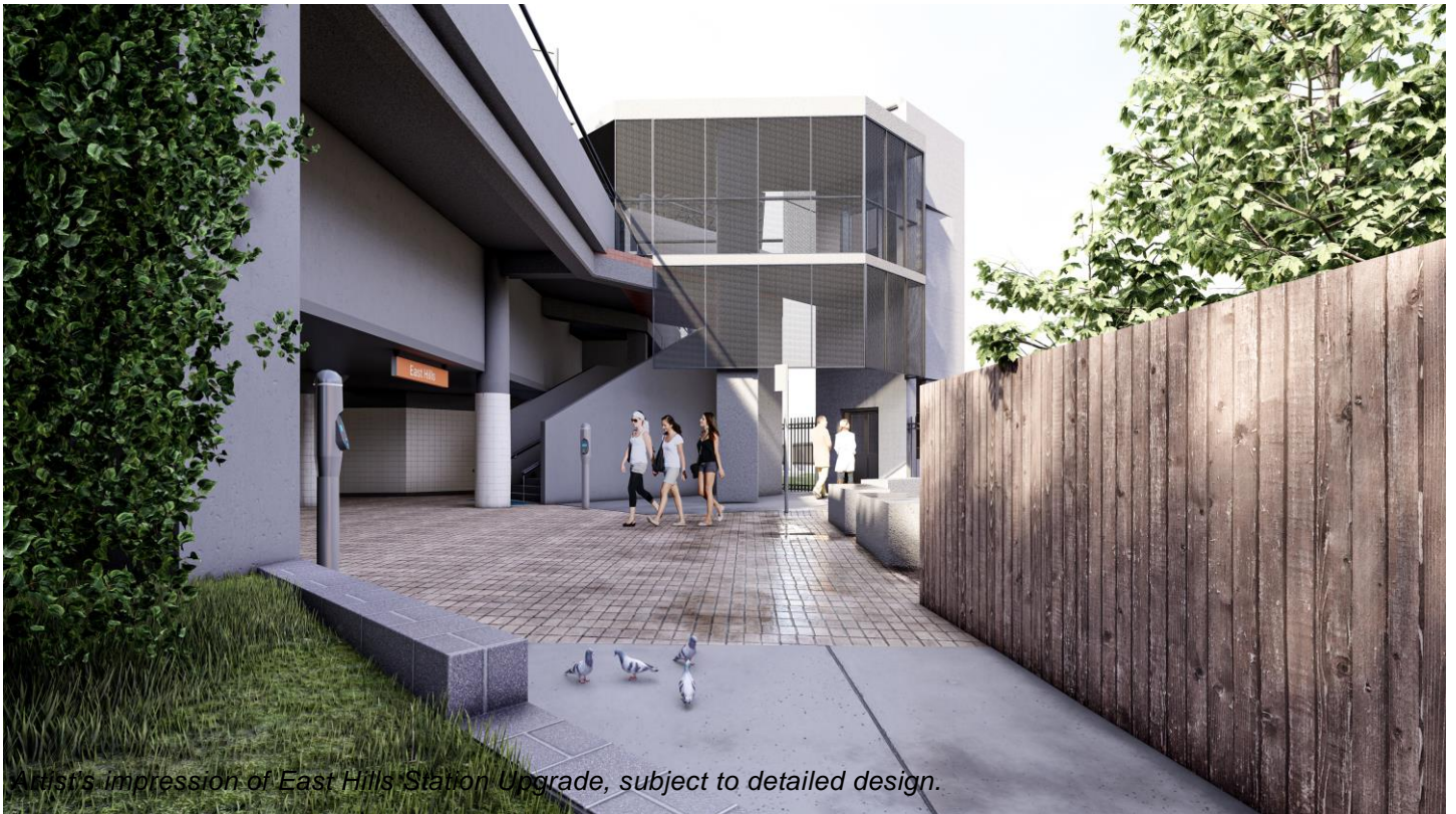
Artist's impression of East Hills Station Upgrade, subject to detailed design.