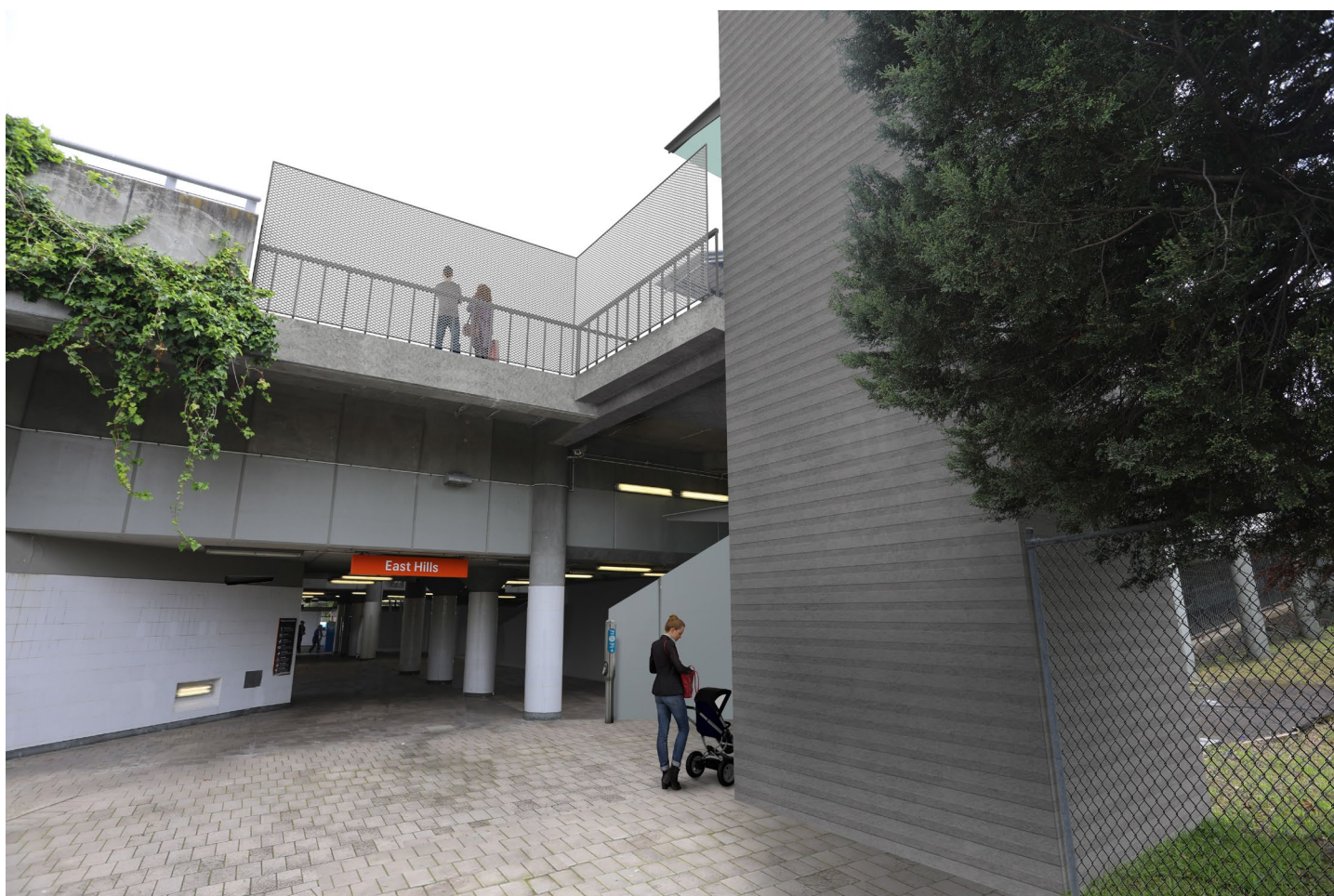
Artist's impression of East Hills Station Upgrade, subject to detailed design.