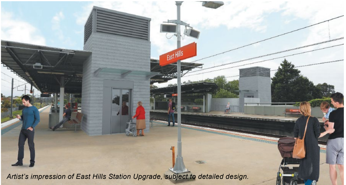
Artist's impression of East Hills Station Upgrade, subject to detailed design.