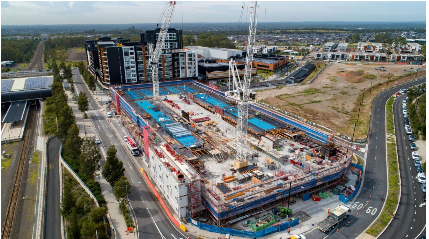
Construction progress on the new multi-storey car park at Edmondson Park, March 2021

Transport for NSW is delivering more commuter car parking at Edmondson Park Station to provide you with more convenient access to public transport and reduce congestion on our roads.