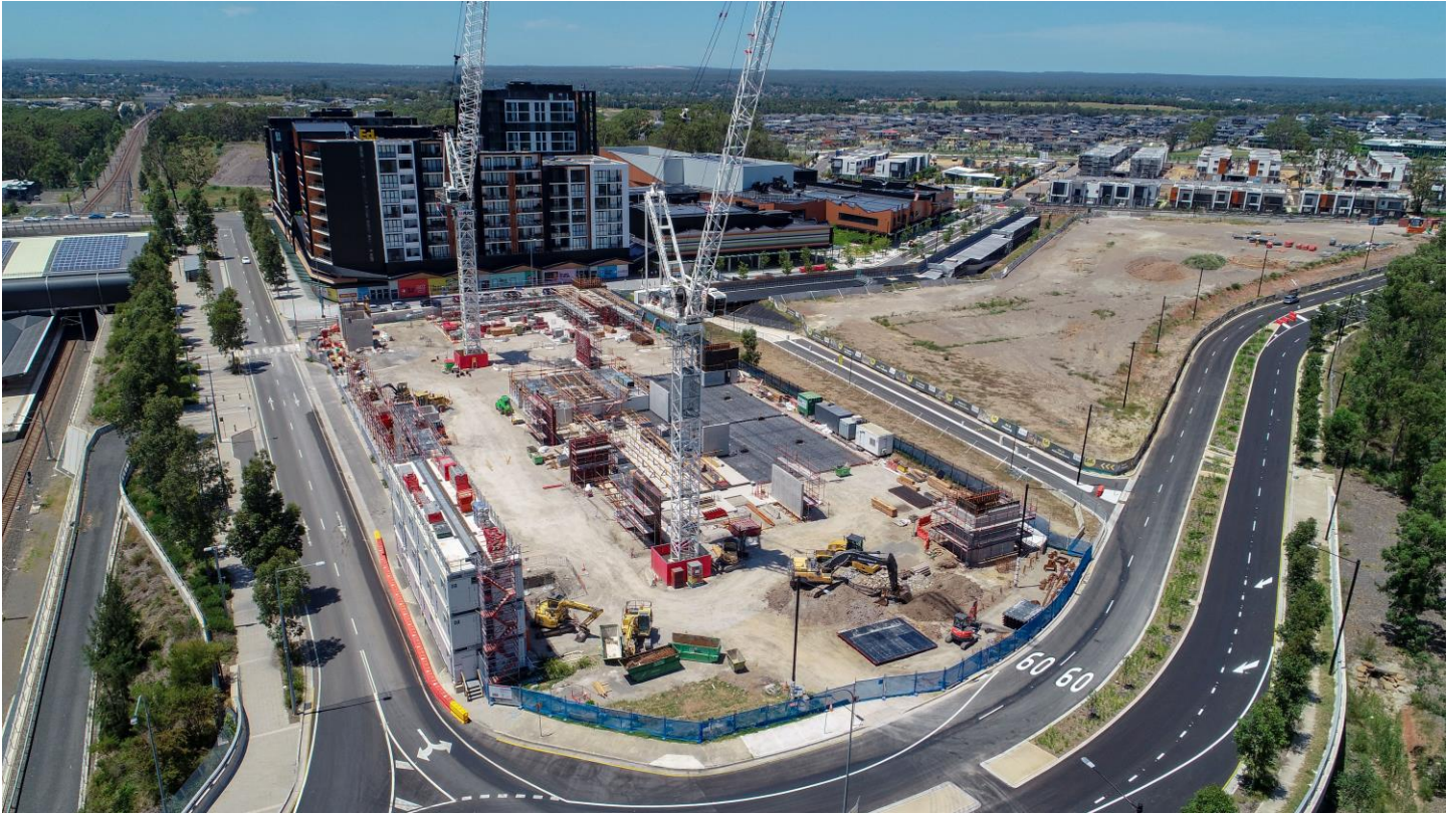
Construction progress on the new multi-storey car park at Edmondson Park, January 2021

Transport for NSW is delivering more commuter car parking at Edmondson Park Station to provide you with more convenient access to public transport and reduce congestion on our roads.