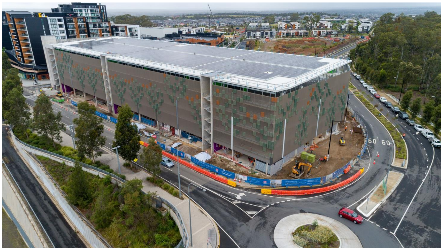
Construction progress on the new multi-storey commuter car park at Edmondson Park

Transport for NSW is delivering additional parking spaces for commuters at Edmondson Park Station to provide you with more convenient access to public transport and reduce congestion on our roads.