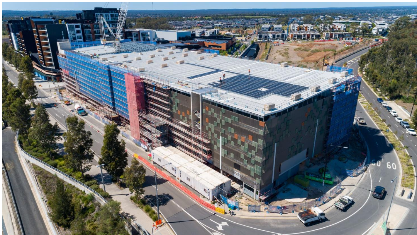
Construction progress on the new multi-storey car park at Edmondson Park

Transport for NSW is delivering additional parking spaces for commuters at Edmondson Park Station to provide you with more convenient access to public transport and reduce congestion on our roads.