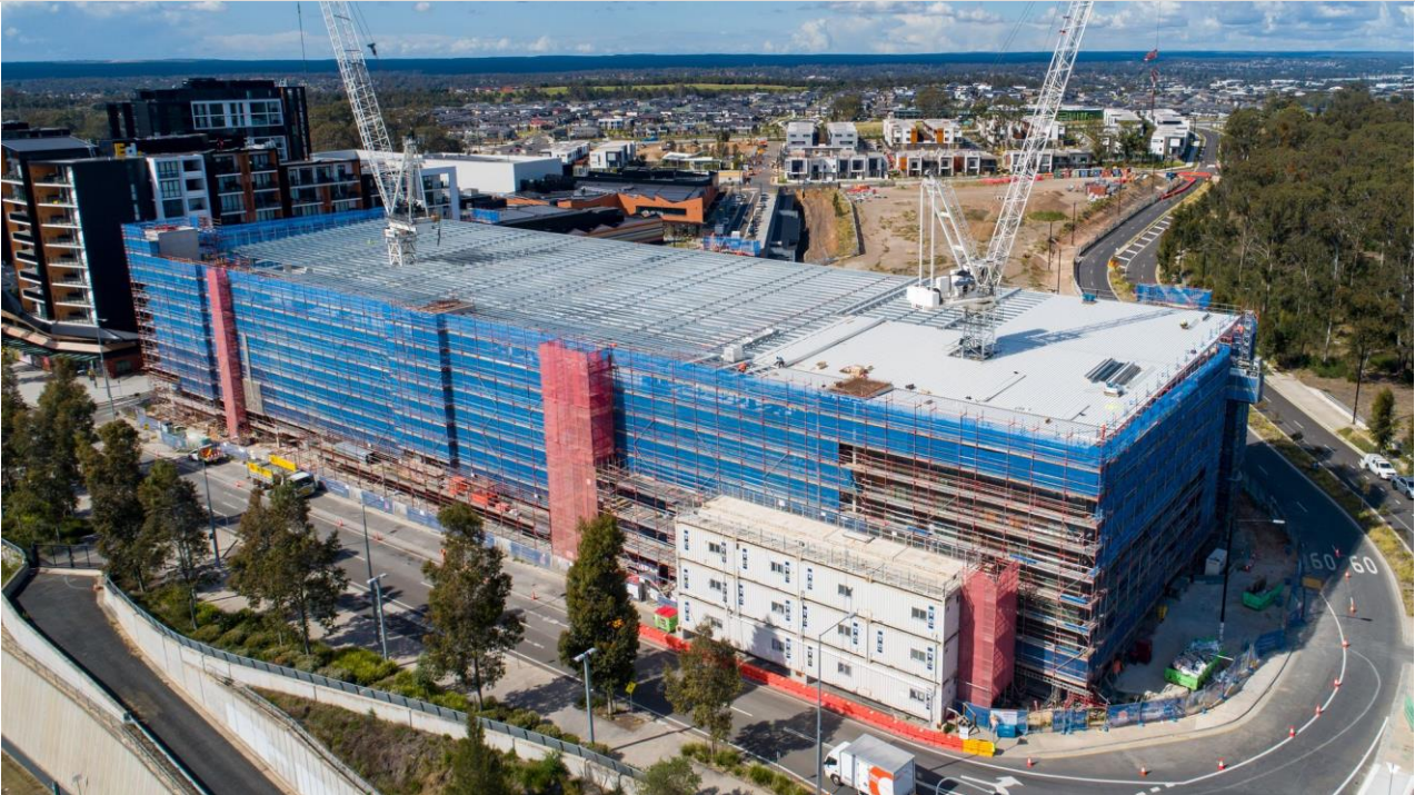
Construction progress on the new multi-storey car park at Edmondson Park

Transport for NSW is delivering up to additional commuter parking spaces for commuters at Edmondson Park Station to provide you with more convenient access to public transport and reduce congestion on our roads.