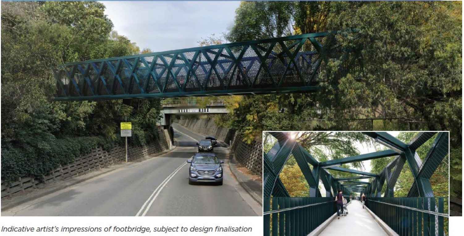
Indicative artist's impressions of footbridge, subject to design finalisation

Transport for NSW is constructing a new commuter car park at Emu Plains Station to provide the community with more convenient access to public transport and reduce congestion on our roads. The project is jointly funded by the Australian and NSW Governments.